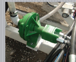
Hydraulic Water Pump (Standard)