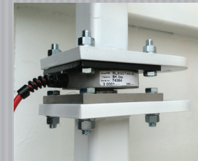
Hopper Scales (Standard)