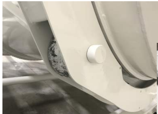
OshGosh Heavy Duty Bearings

Electric Motor Diesel Engine 25 Gallon water tank Gravity Load Chute