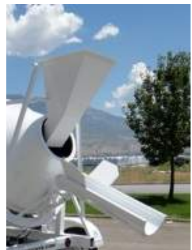
Gravity & Discharge Chutes