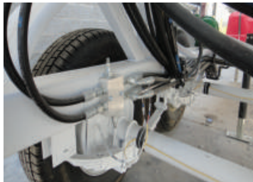
Full Hydraulic System runs off of the Diesel, Gas, or Electric engine.